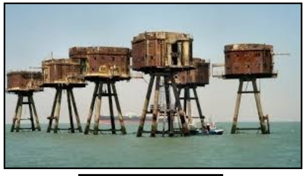
Thames Estuary Forts

Four Naval forts were erected for the Admiralty in the North Sea at intervals from opposite Harwich to opposite Margate.